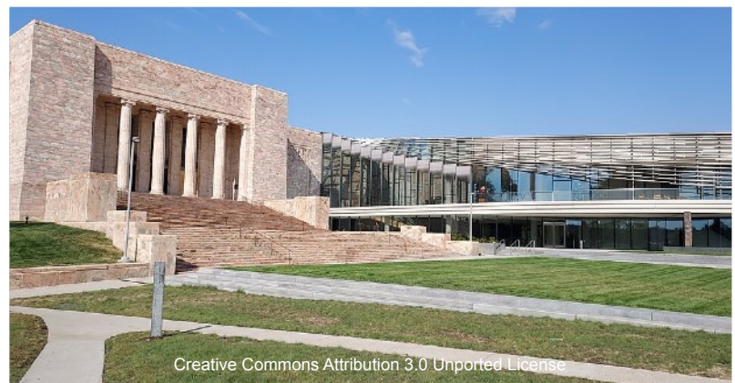
Creative Commons Attribution 3.0 Unported License

The newly renovated Joslyn Museum is beautiful to see and to examine the vast array of art. We will depart at 9:00am on October 2 by bus. Upon our arrival at 10:00 am, we will be greeted by Gallery Volunteers who will provide us with tours of the museum. We will have lunch in the Durham Cafe at 11:00am and then have time to visit parts of the museum not seen on the tour and visit The Shop. We will depart for Lincoln at 1:30pm.