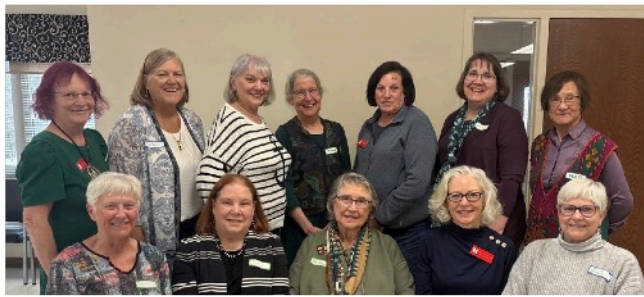
Interest Group Chair Luncheon